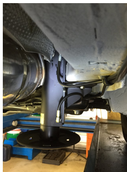
Right side of the vehicle.