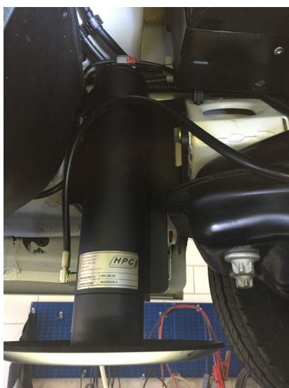
Left (driver's) side of the vehicle.

Installing method of the mounting plates under the vehicle. The ground clearance must be at least 17 centimeters.