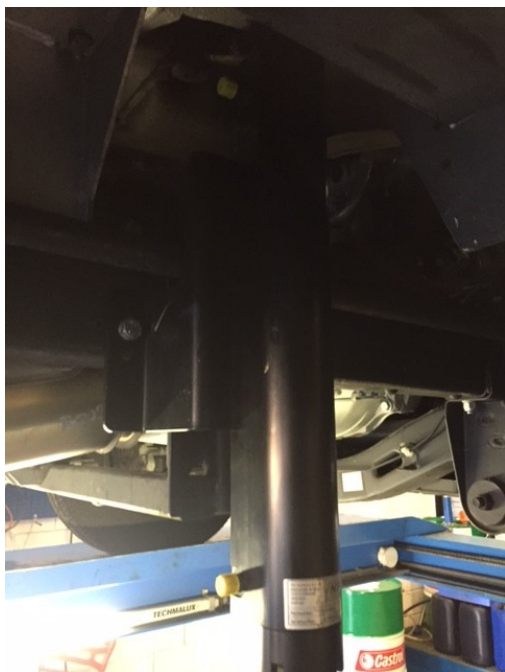
Right side of the vehicle.