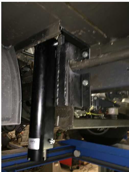
Left side (driver's side) of the vehicle.

Installing method of the mounting plates under the vehicle. The ground clearance must be at least 17 centimeters.