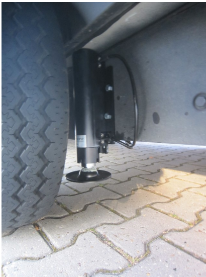
Left side (driver's side) of the vehicle.

Mounting method of the universal mounting plates under the vehicle. Take into account a ground clearance of at least 17 centimeters.