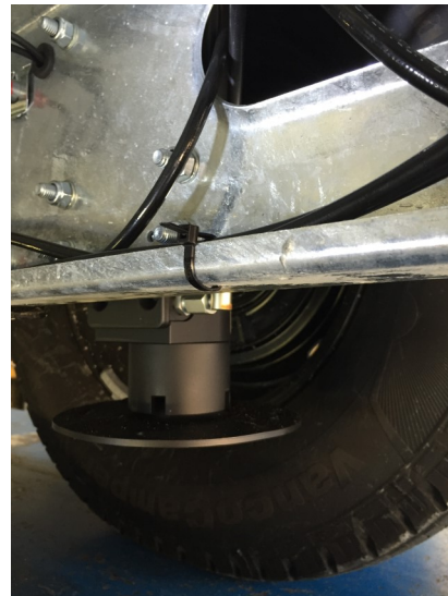
Right side of the vehicle.