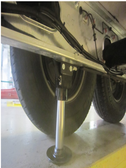
Left side (driver's side) of the vehicle.